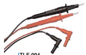
TLF-004 1000V CAT IV Leads