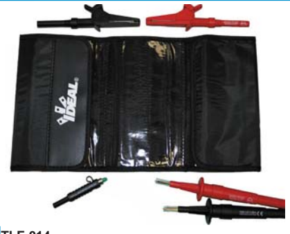
TLF-014 CAT IV Custom Kit Kit contains: 1kV Cat IV Probes with Shuttered Spike, 1kV Alligator Clips, Lead/Fuse Tester and Four-Pocket Tool Roll Organizer