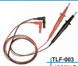
TLF-003 1000V CAT III Leads