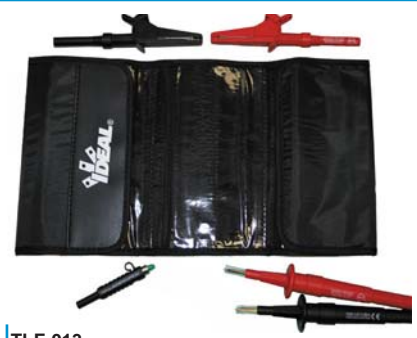
TLF-013 CAT III Custom Kit Kit contains: 1kV Cat III Probes with Shuttered Spike, 1kV Alligator Clips, Lead/Fuse Tester and Four-Pocket Tool Roll Organizer